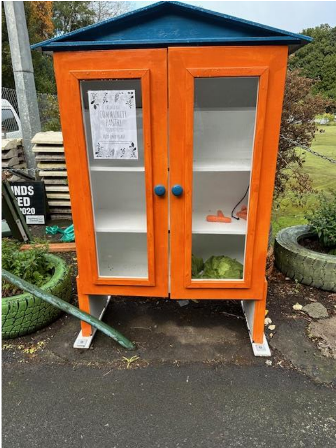
GHub's Pataka Kai. If you have spare food or would like to donate, please add food to share with others