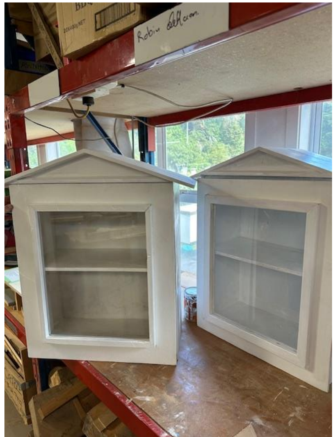
Small Pataka Kais for various charities